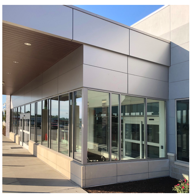
New entrance canopy and vestibule

Recently, McLaren Health was looking to expand in the mid-Michigan community of West Branch. Three sites were evaluated; space within an existing strip retail center with good freeway visibility, an abandoned big box retail site without freeway exposure but surrounded by community development, and a vacant site. After careful consideration, the shopping center was ruled out due to the long, thin nature of the building which was not conducive to a large ambulatory building that relies on interactive adjacencies of medical disciplines. The greenfield site was ruled out for many of the reasons discussed in this paper. The available big box retail site was selected for the available community access, construction cost savings and reduced project schedule.